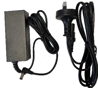
EFTPOS TERMINAL POWER CABLE