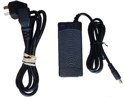
MAIN UNIT POWER SUPPLY