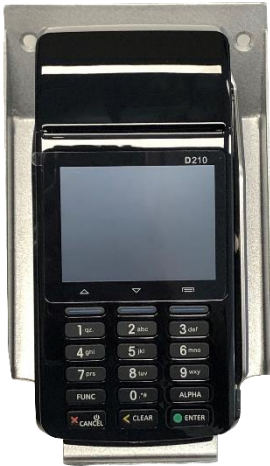
EFTPOS TERMINAL BRACKET